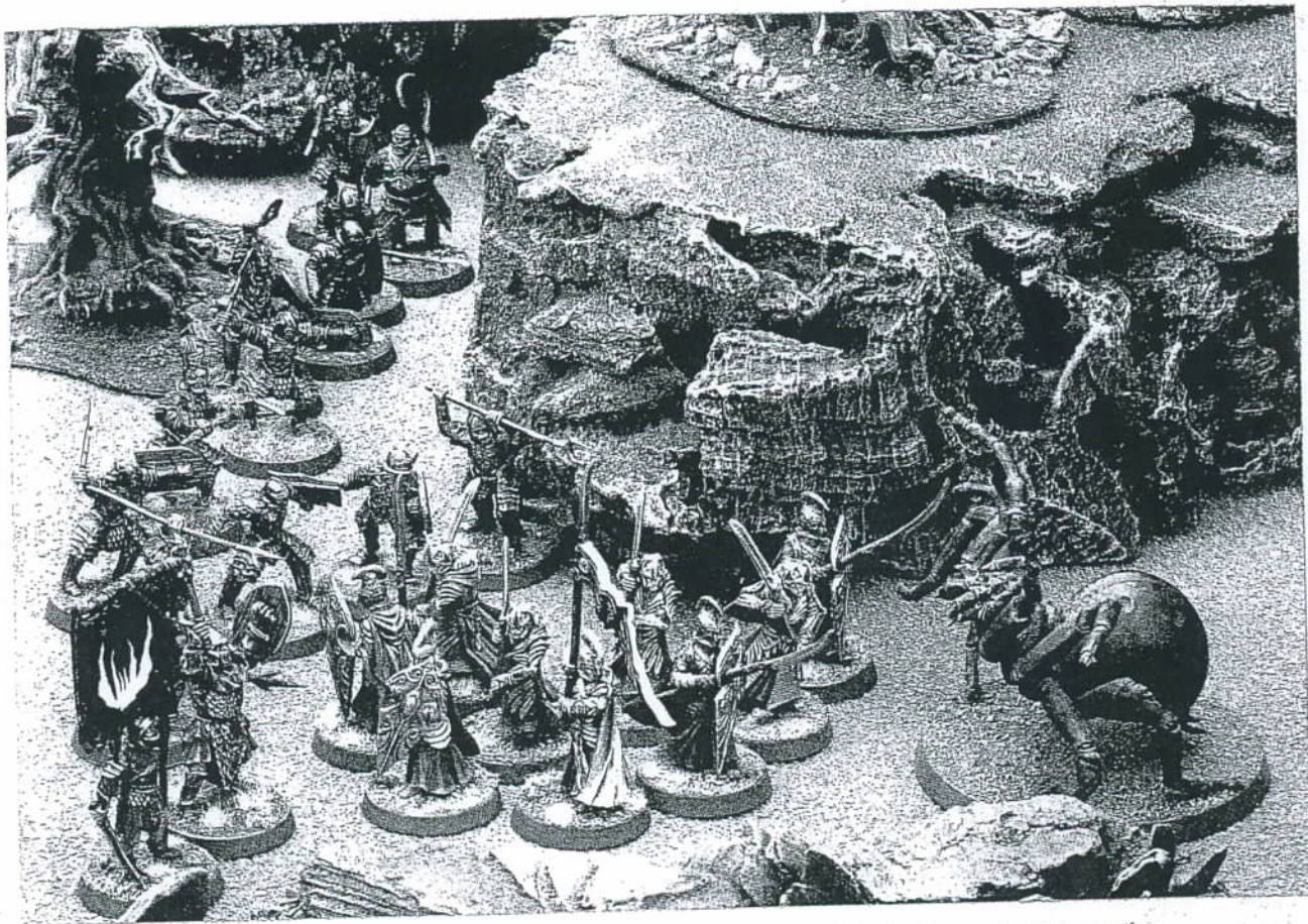
Trapped between Shagrat's cohorts and the fearsome bulk of Shelob, the Elves make their stand.